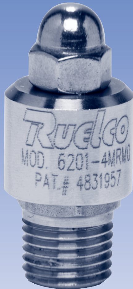
Model 6201 Hydraulic