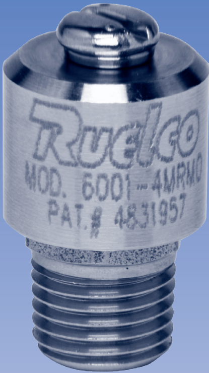
Model 6001 Pneumatic